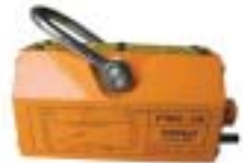
Permanet Magnet Lifter-33SH