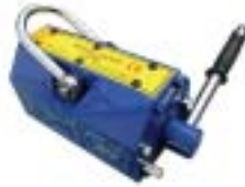
Permanet Magnet Lifter-30SH