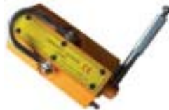
Permanet Magnet Lifter-48H