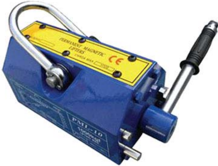
Permanet Magnet Lifter-30SH