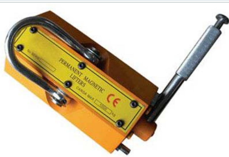
Permanet Magnet Lifter-48H