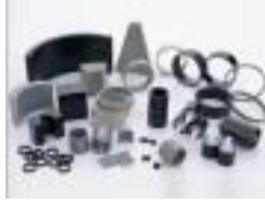
Compression Moulding Bonded NdFeB Magnet-N48M