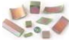
Sintered NdFeB Magnet-35EH