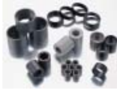
Injection Moulding Bonded NdFeB Magnet-N42