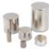
Sintered NdFeB Magnet-LN9