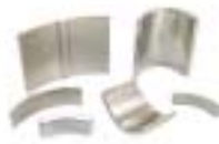
Sintered NdFeB Magnet-38EH