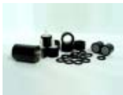
Injection Moulding Bonded NdFeB Magnet-N45